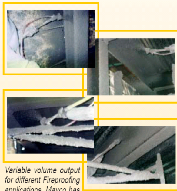
Variable volume output for different Fireproofing applications. Mayco has the right pump for your job.