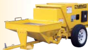
Plaster & Fireproofing Pump