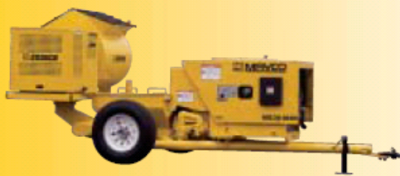
Plaster & Fireproofing Pump with Mixer