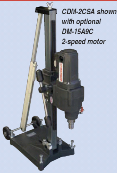
CDM-2CSA shown with optional DM-15A9C 2-speed motor

The CDM-2CSA is a compact drill rig for smaller applications. The unit can be mounted by bolting down or vacuum with the optional CDM-VP vacuum pump assembly (not shown).