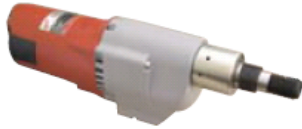
Milwaukee 4096 Slip Clutch