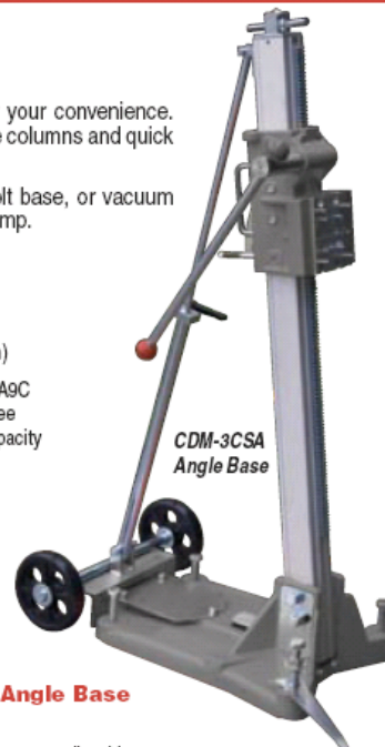
CDM-3CSA Angle Base