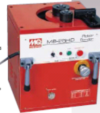
Model MB-25HD can bend 1" rebar a full 180 degrees in just 5 seconds and handles up to 4 pieces of 1/4" rebar at a time.