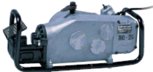
Model BC-25 cuts rebar up to 1" and offers continuous cycling for high production.

Cutting blades are manufactured from heat-treated, high-strength machine steel, easily rotated for prolonged use and increased service life.