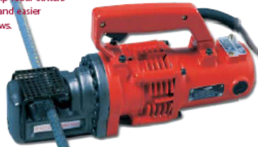
Model HBC-19 cuts rebar up to 0.75" thick in only 3 seconds.

Use the HBC-series for maximum versatility. These electro-hydraulic cutters handle virtually any rebar cutting job, from slabs and masonry walls to large buildings and bridges. At only 18 to 48 lbs, the HBC is easily carried around job sites. Even overhead work takes minimum effort.